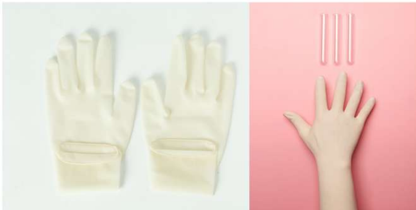
Medical examination gloves Specification: 5.5g, 6.0g, 6.5g/piece Powdered or Powdered-free Sterile or E0 sterile