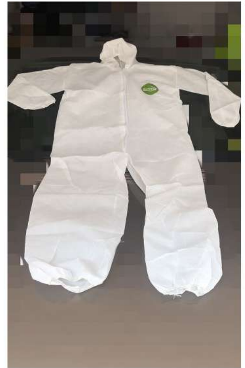
Protective clothing Sterile or E0 sterile Specification: 23, 41